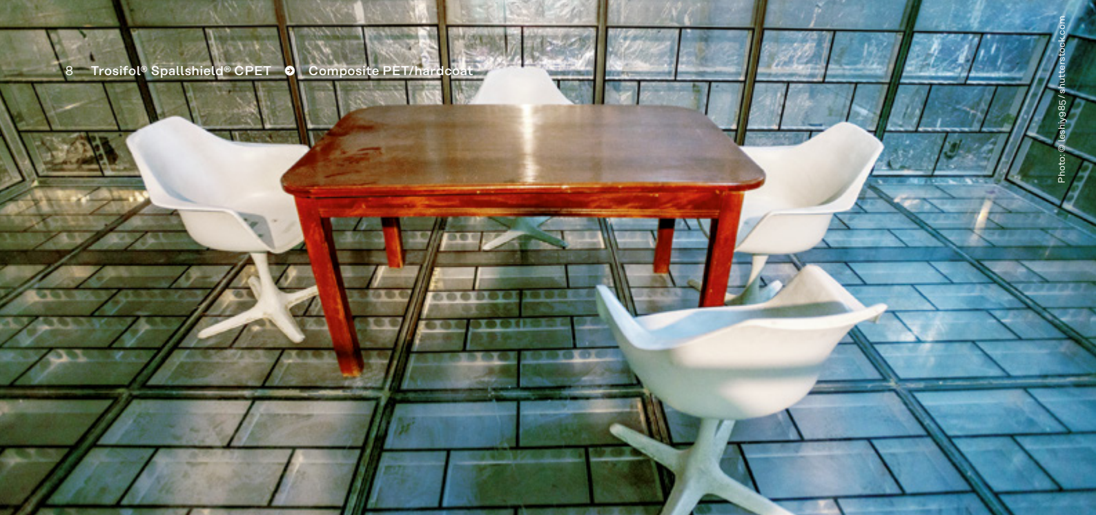
● Glass room in former US Embassy