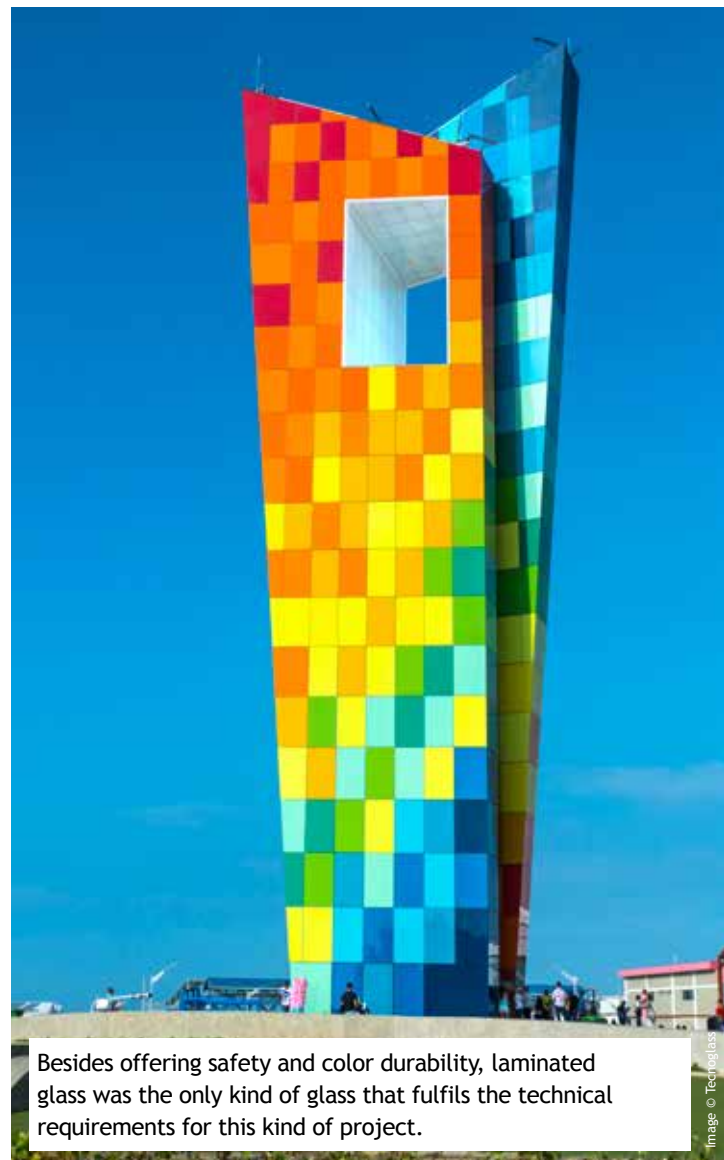
Besides offering safety and color durability, laminated glass was the only kind of glass that fulfils the technical requirements for this kind of project.

“Laminated glass is an industry transformer,” Daes concludes, “because it’s capable of providing durability, high performance and multiple functional benefits, such as safety, security and sound control, as well as hurricane and blast resistance. Indeed, the monument is able to resist winds of up to 200 km/h. During the design and con-