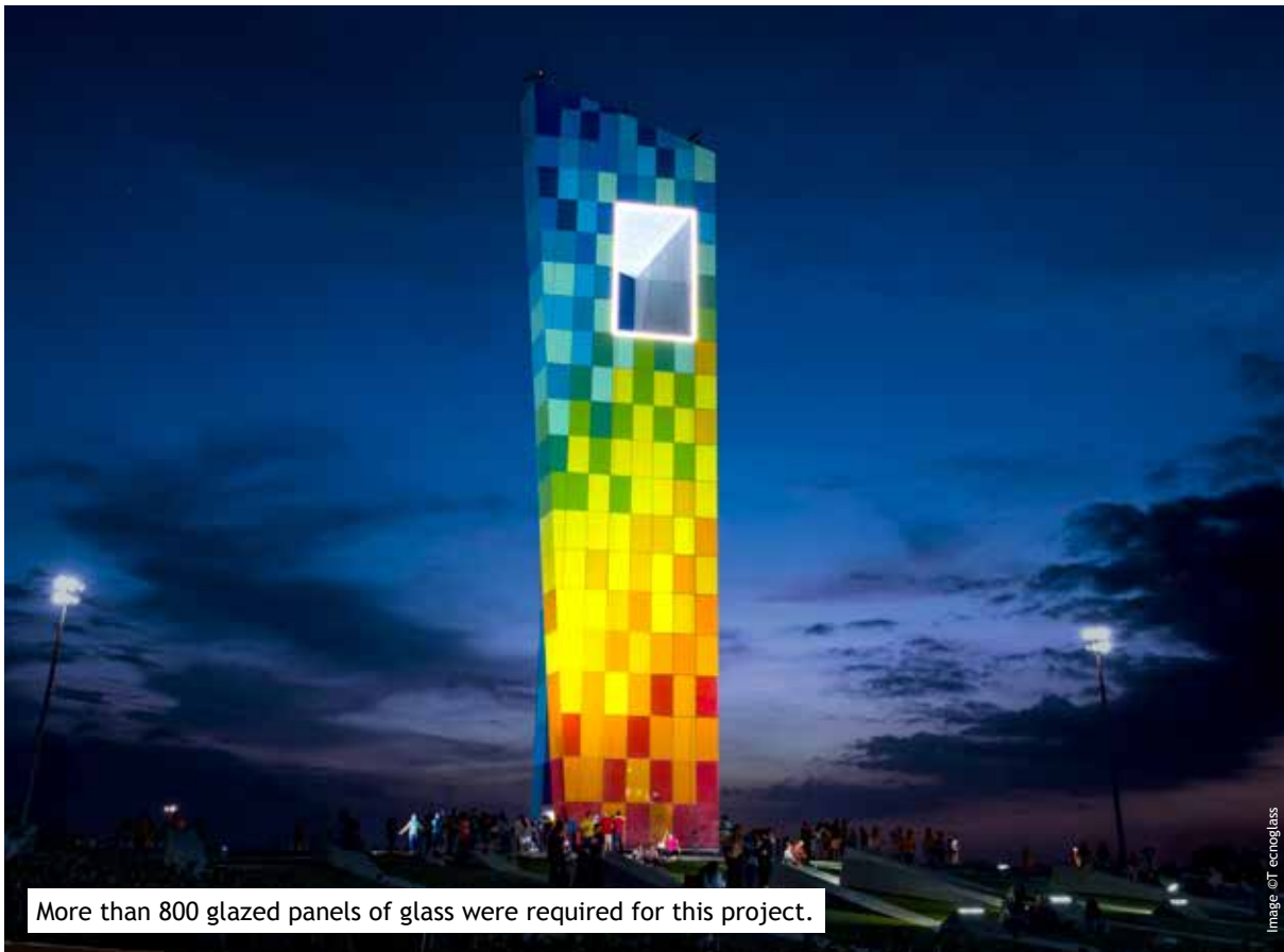
More than 800 glazed panels of glass were required for this project.

According to Daes: “One of the requirements for the design of the monument was that it had to be made of glass and aluminium, which are the main products