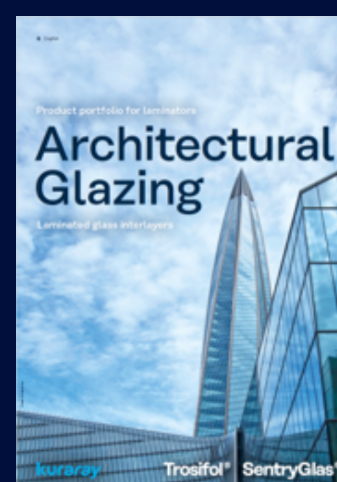
For laminators engineers, etc.