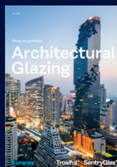
For architects, designers, engineers, etc.