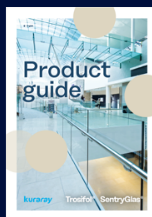
Overview of all products